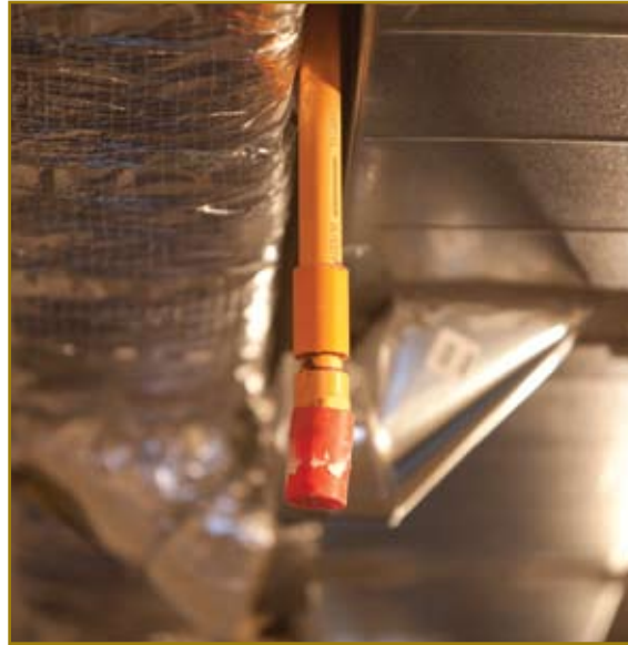
PROTECTED SPRINKLER SUSPENDED FROM CEILING

There are also specific sprinkler-related issues to be considered in contemplating either the early installation of a permanent sprinkler system, if one is to be