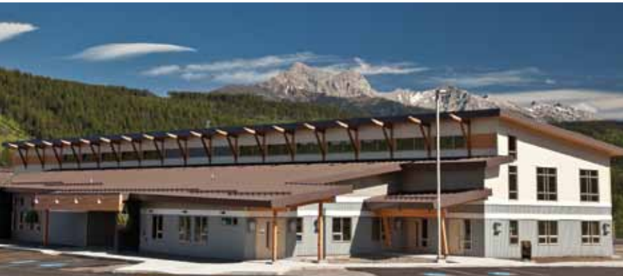
Elkford Community Conference Centre