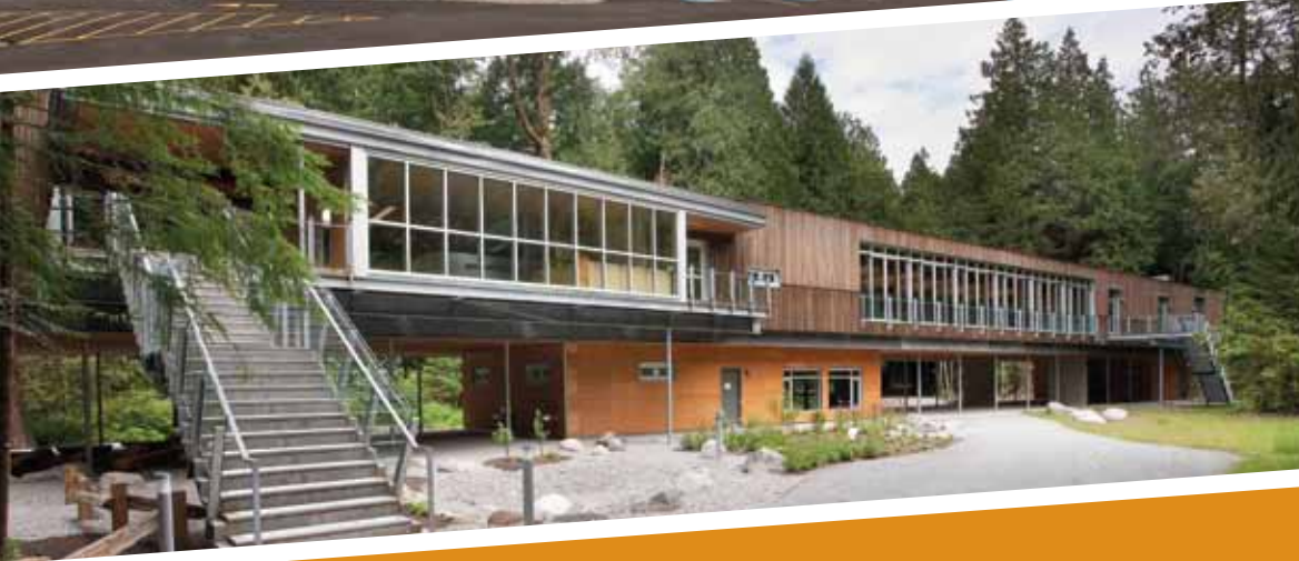
North Shore Credit Union Environmental Learning Centre