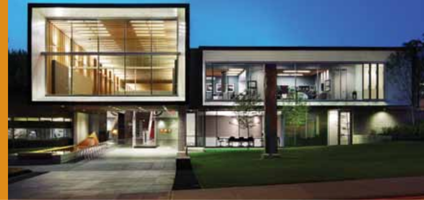
The City of North Vancouver Civic Centre Renovation

A CASE STUDY SHOWCASING THREE DEMONSTRATION PROJECTS